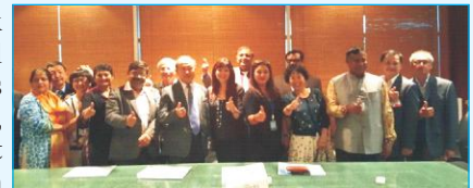
Signing of the Bangkok Accord

Engineering Council of India, the Apex Federation of 32 Indian Professional Engineering Institutions/Associations representing all engineering streams in India, was created in 2002 to oversee the development of engineering profession in India. In continuation of its mandate, it has now entered