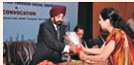
Inaugural Session of Engineers Day Celebrations - 2017

ICE(I) celebrated Engineers' Day on 15th September, 2017 at A P Shinde Auditorium, NASC Complex, PUSA, Delhi-12. It was a daylong programme comprising National Seminar on "Enhancing Opportunities through Social Engineering" which was inaugurated by Sh. Mukhtar Abbas Naqvi, Hon'ble Minister of Minority Affairs, Government of India.