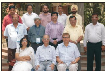
EDP-3, Effectiveness of Technology Management for Engineers during April 26 - 28, 2011

Practising engineers should be invited to address the students through "Show and Tell" sessions which will complement faculty teaching, not substitute it. This should start right from the beginning of the first semester. Students should visit factories, design offices, sites, installations right from the first semester, guided by the same working engineers who have been speaking to them. Institutes should involve practicing engineers into drafting and detailing of the curricula. Any comment, please mail it to eci@ecindia.org .