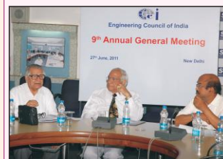
9th AGM on June 27, 2011 at New Delhi in Progress