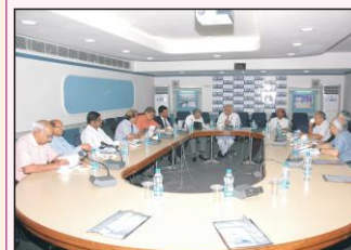
28th BOG on June 27, 2011 at New Delhi in Progress