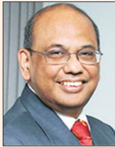
Shri N. Chandrasekaran

Financing : Integration of clean-energy technologies in World Bank financing; utilization and mainstreaming of GEF and Montreal Protocol funds; business model framework of the Green Climate Fund; Aggregation and bulk procurement of LED lights for market transformation; Creation of a Partial Risk Guarantee Fund and a Venture Capital Fund to stimulate investment in energy efficiency