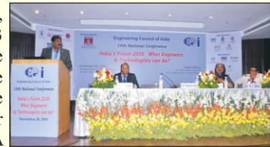
14th National Conference - The Panel Discussion in progress

session. The topics, covered by the 13 speakers, were quite informative and were well appreciated by the audience, for their quality and depth. A Souvenir was also