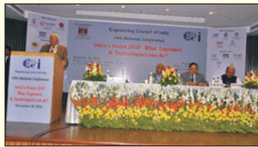
14th National Conference - The Opening Session in progress

The 14th National Conference was held on 28th November, 2016. It was well attended by around 260 delegates. Both our Chief Guest : Shri Arjun Ram