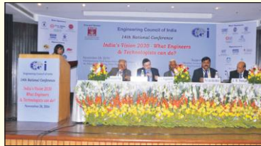
14th National Conference - The 1st Session in progress

could not come due to last minute urgent engagements elsewhere. A wide variety of topics in the presentations relevant to the theme, were taken up, which were followed by a lively question-answer