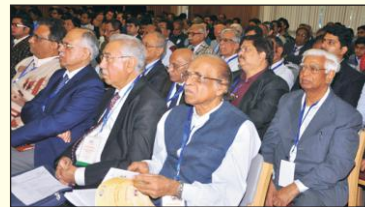
14th National Conference - The Audience