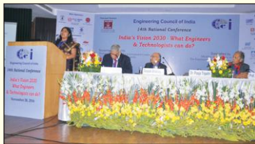
14th National Conference - The 2nd Session in progress

could not come due to last minute urgent engagements elsewhere. A wide variety of topics in the presentations relevant to the theme, were taken up, which were followed by a lively question-answer